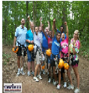
The NYAC Team